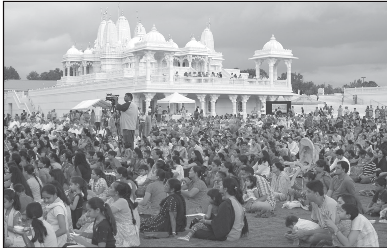
BAPs devotees watch the Krishna Lila on the temple grounds.

Atlanta: Hindu Temples, shrines and community centers in Atlanta wore festive looks on the eve of Janmashtami, a celebration of remembering the birth of Lord Shri Krishna, one of the greatest enlightened Masters of the universe. The Hindu temple of Atlanta,