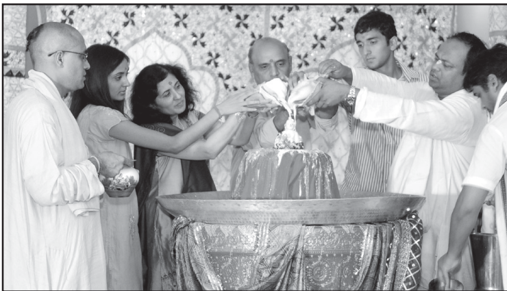
Ksheerabhishekam to little Krishna at Shree Shakti Mandir.

For more details and directions call 678-467-0837, 770-270-1758, 770-495-7064 or visit www.culturesacrossborders.org .