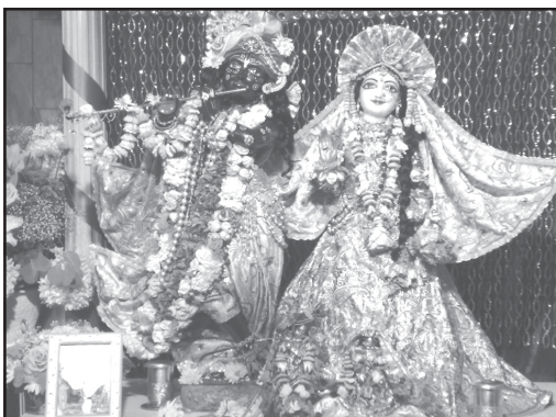
Snapshot from the ISKCON temple.

the birth anniversary of Lord Sri Krishna from August 14 to 16. Events were marked with traditional prayers, bhajans and discourses in the daytime followed by colorful cultural presentations in the evening.