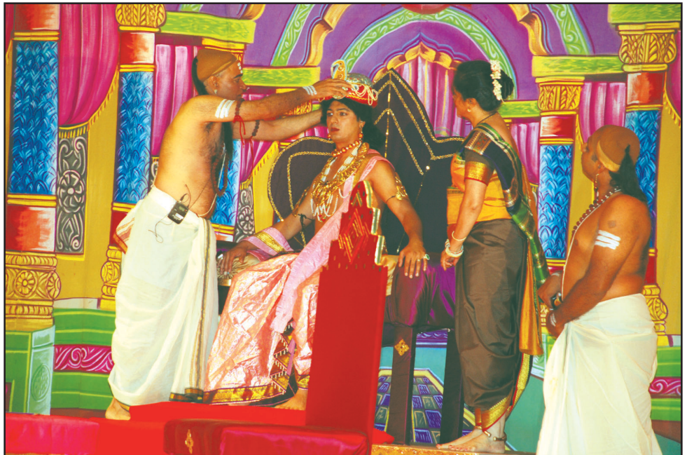
A scene from Syam Yellamraju's mega historical drama "Chanakya". Full report on Pg 7.

The Indian government has also pointed out that Buddhi remains in jail even though no sentence has been pronounced.