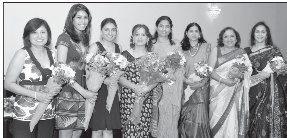
Pageantry of prominent community members, ready to present bouquets to the dignitaries at the banquet.

let us create a new global community where freedom, justice, and human rights, for all people will indeed reign supreme."