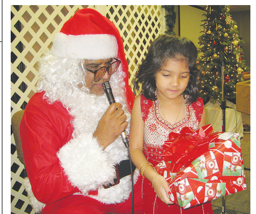
Christmas celebrations at the First Asian Indian Baptist Church. Full report on Pg 7.

This was the first time in the history of TAMA that all the incumbent contesting office bearers lost. There were allegations of mismanagement of membership, ethical improprieties, etc. against them. TAMA was even dragged into a