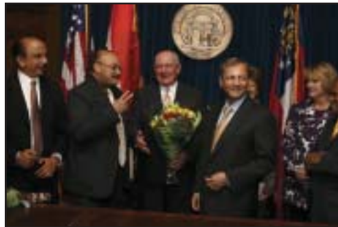
Gov. Sonny Perdue, Ambassador Ronen Sen with community members at the State Capitol.